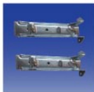
M01 - 004 Double Bracket