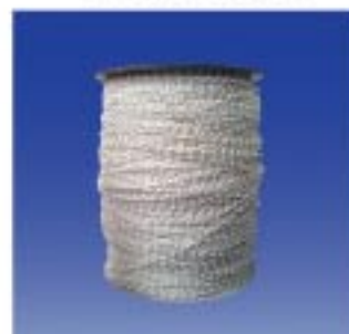
019 - Chain